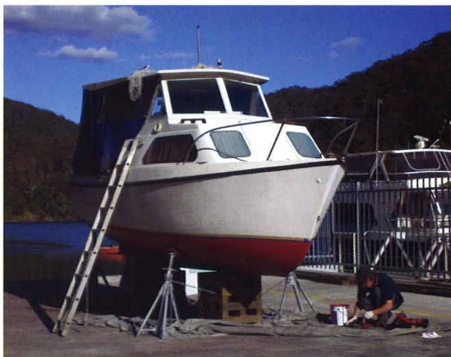
Working on Mirror Image.

* For more information on the Marine Card – Occupational Health & Safety course contact the BIA 02 9438 2077.