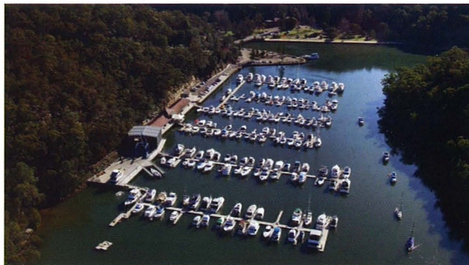
Aerial view showing the new hardstand area.

To compliment its hardstand and vessel maintenance operations, the marina also has a café, fuel wharf and boat brokerage.