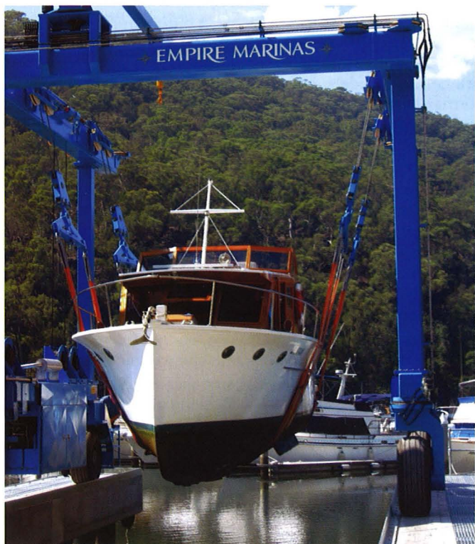
State-of-the-art 50-tonne travelift.