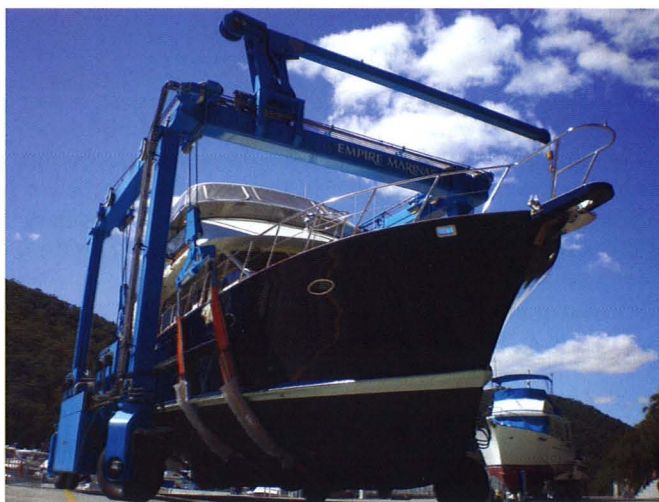
Sixty five footer in slings.