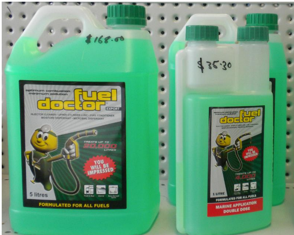
Fuel Doctor - protection for your fuel tanks

At Empire Marina Bobbin Head our Premium Unleaded and Diesel is delivered direct from the refinery. For environmental and fuel integrity purposes we regularly vacuum and pressure test our tanks and fuel lines and take regular samples of our fuel to verify fuel quality.