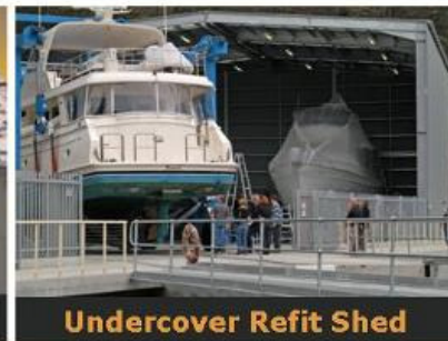
Undercover Refit Shed

Contact Roy South 02 9457 9011 www.empiremarinas.com.au