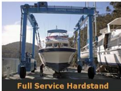
Full Service Hardstand