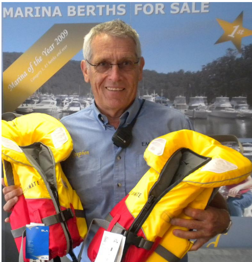
Adult and child sized jackets are available from the Marina Office